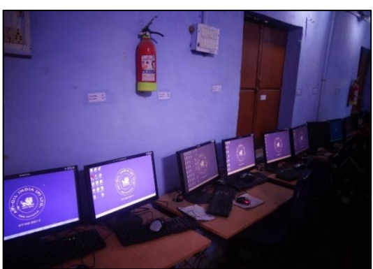
Almira, UPS with Batteries & and Computer Spares for Computer Laboratory