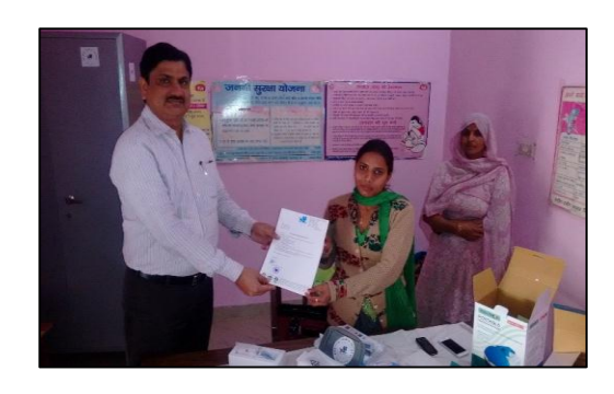
Storage Almirah, Chair and Health Equipments