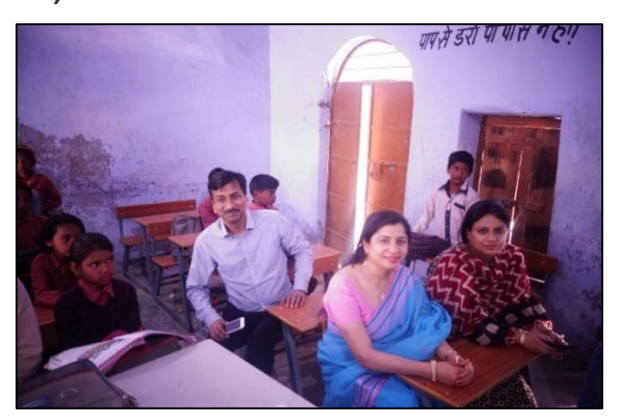
Dual Desk for 1 to 5 class students