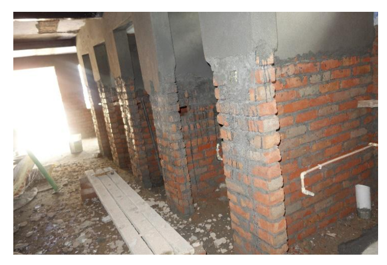
Girls Toilet (Post Photos)