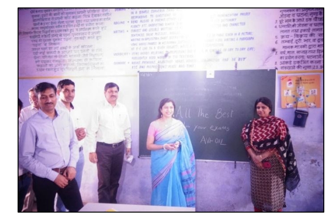
Black Board (Green colour) for class rooms