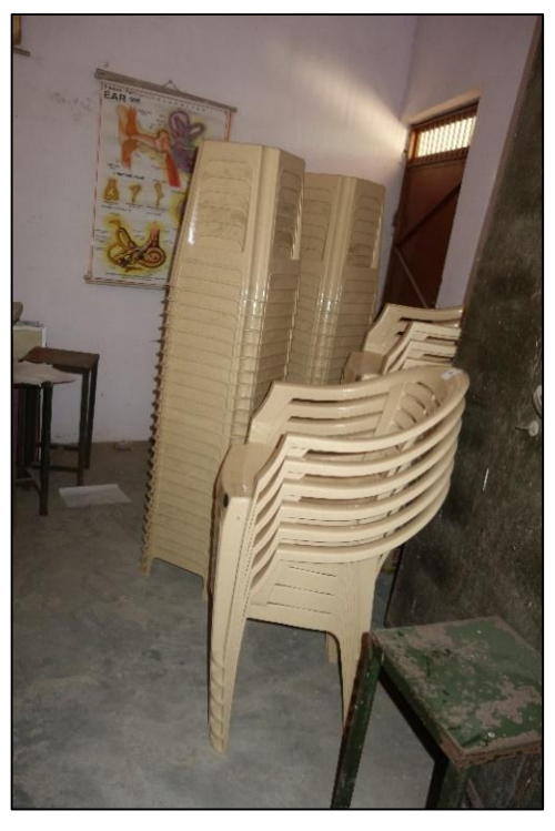
Plastic Chairs with Arms & Plastic Stools